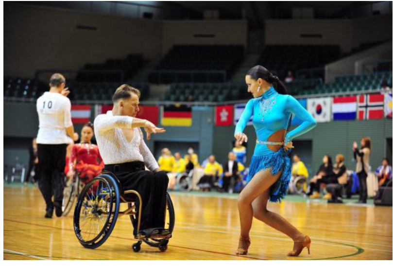
The 2013 IPC Wheelchair Dance Sport World Championships were held in Tokyo, Japan.

More than 160 athletes from 29 countries expected to travel to Italy hoping to win couples and singles titles